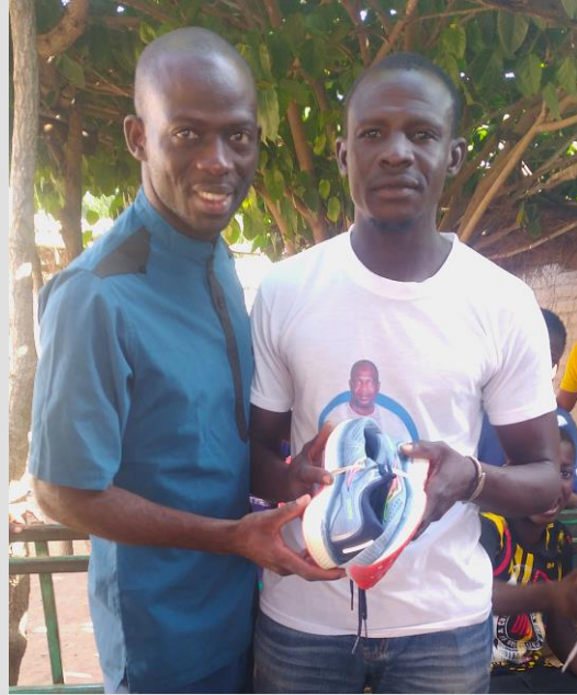
The best gift of all is eternal life in Jesus!