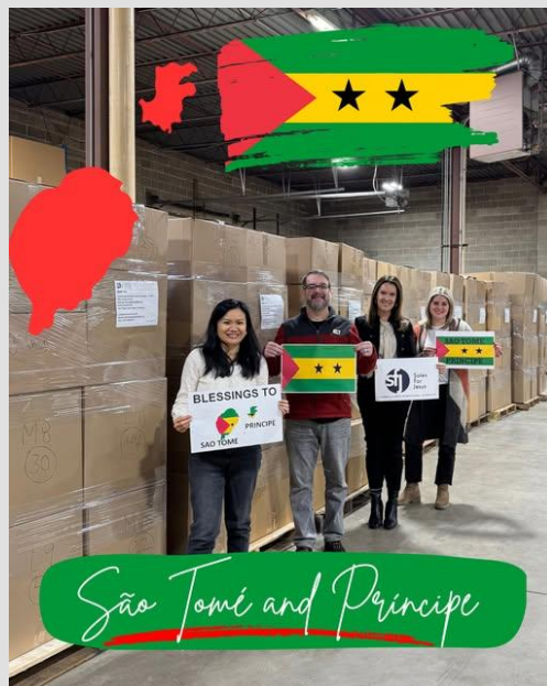
Love and Prayers for São Tomé & Príncipe