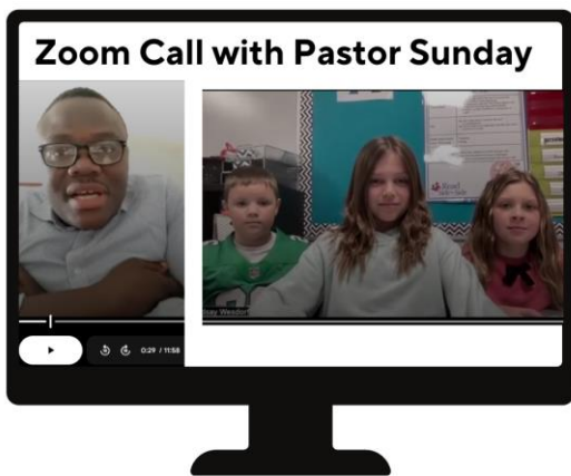
DMCS invites a chapel speaker from Benin, Africa!