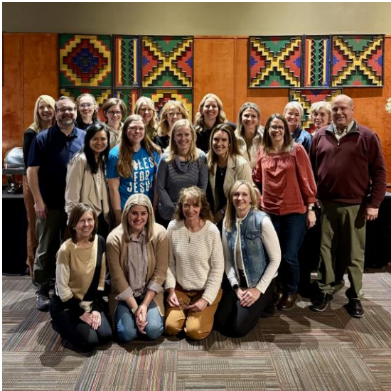
Celebrating this amazing team of volunteer leaders!