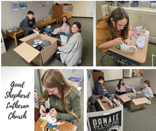
Good Shepherd Lutheran Church

Good Shepherd Lutheran Church, Watertown - Look at these creative students from Good Shepherd Lutheran Church and the fun shoes they have decorated. They organized a shoe drive and decided to add a personal touch by making notes and decorating several pairs as well. We are excited about the impact these gifts will have on many kids and adults in Africa!