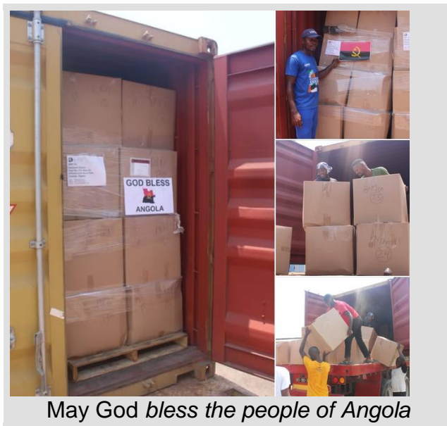
May God bless the people of Angola