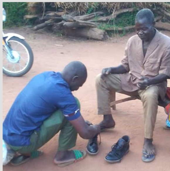
Sharing God's Love in Chad