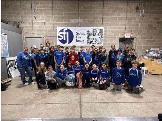
Thank you for serving, Brookfield Christian School!

“Business Hours” SOS: Volunteers can also come during weekdays to pack shoes (Mon-Fri, 9am-4pm). Come and sort shoes when it fits your schedule. You are welcome to stay for an hour or for the day. It's entirely up to you and please feel free to bring friends! Training will be provided and SFJ staff will be available to provide support.