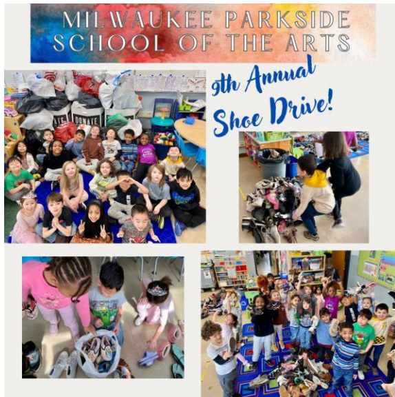
9th Shoe Drive at MKE Parkside School of the Arts!