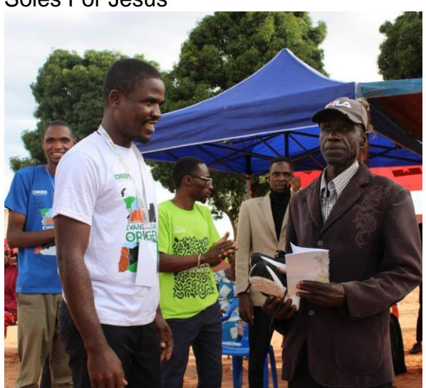
God is moving in Angola!