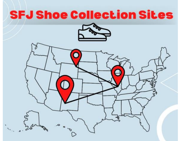
Click map above to VIEW Collection Sites!

We are so thankful for our Collection Sites across the U.S. that collect shoes year-round! We are always praying to expand our reach across the nation, so if you know of a transport company willing to help deliver them to our warehouse, or a church, business or school interested in becoming a Collection Site please reach out for more information by calling 414-365-1392 or emailing Info@SolesForJesus.org.