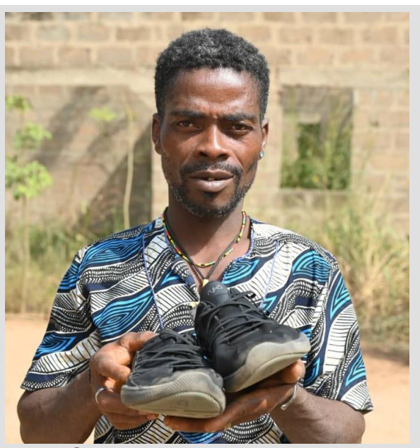
God's love can't be stopped!