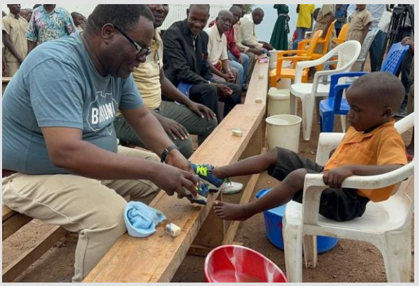
May God Bless each new believer!