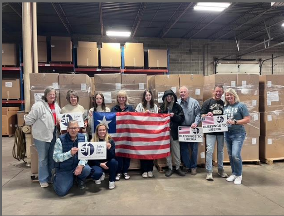
Thank you Portview Church