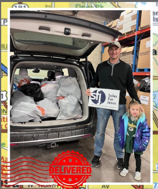
Daddy & Daughter Delivery