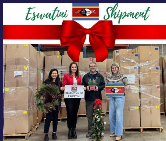
Love and Prayers for Eswatini

Portview Church - We are grateful to partner with Portview Church again, as they organized a shoe drive and brought a group to volunteer in our warehouse. Over 500 pairs were packed and we are excited about the impact this will have on many people in Africa!