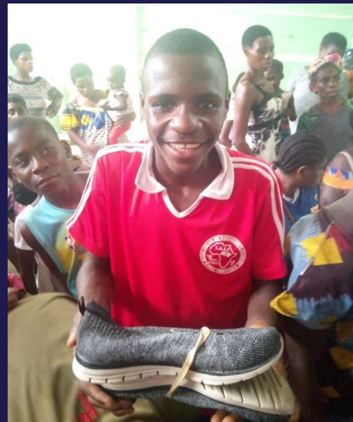
Shoes helped open the door!