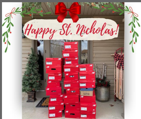
St. Nicholas Shoe Delivery