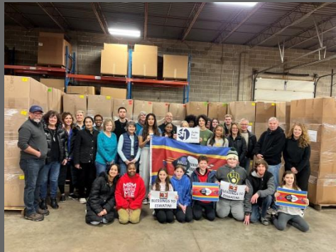
St. John's West Bend and World Impact Ministries

“Business Hours” SOS: Volunteers can also come during weekdays to pack shoes (Mon-Fri, 9am-4pm). Come and sort shoes when it fits your schedule, and feel free to bring your friends! Training will be provided and SFJ staff will be available to provide support.