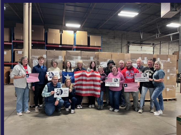
Final Shipment of 2024 to Liberia

Denmark High School - The students and staff at Denmark High School did an incredible job by collecting over 400 pairs of shoes to impact lives in Africa. Special thanks to Hayley