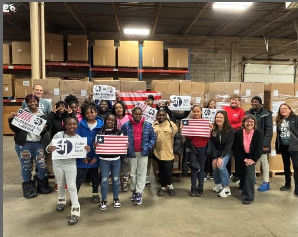
Serving with our community for Africa