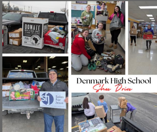
Shoe Drive at Denmark High School

for organizing this shoe drive and God bless you all.