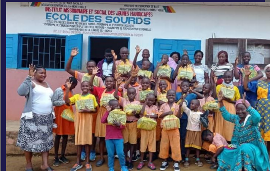
Joy in Cameroon