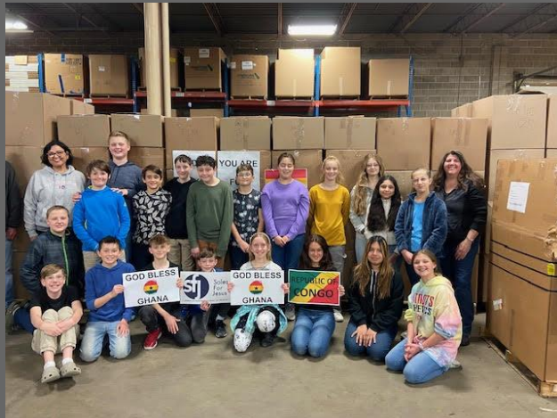
Thank you students from Heritage Christian School

“Business Hours” SOS: Volunteers can also come during weekdays to pack shoes (Mon-Fri, 9am-4pm). Come and sort shoes