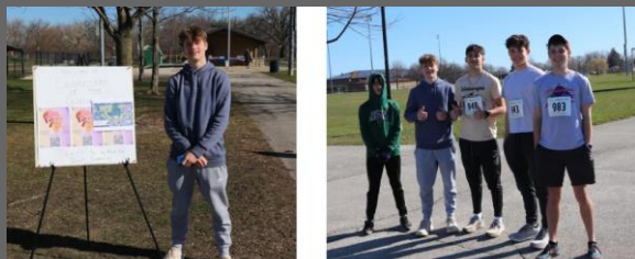
Footprints of Hope