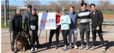
"Footprints of Hope" in Grayslake, IL