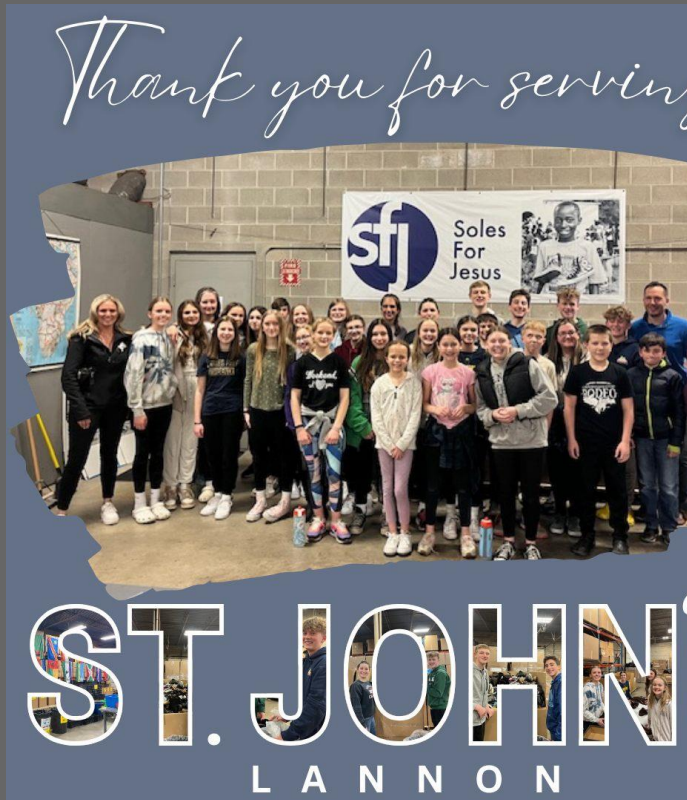
Students from St. John's in Lannon

St. John's Lutheran, Lannon- Our friends from St. John Lutheran's in Lannon arrived this month ready to volunteer their time and to deliver a donation of shoes for Africa! Thanks to this awesome group for your support of the ministry