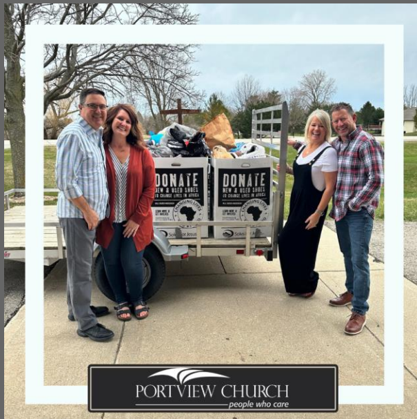
Thank you Portview A/G!