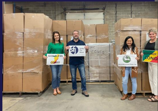
Prayers, Shoes & the Gospel for Congo